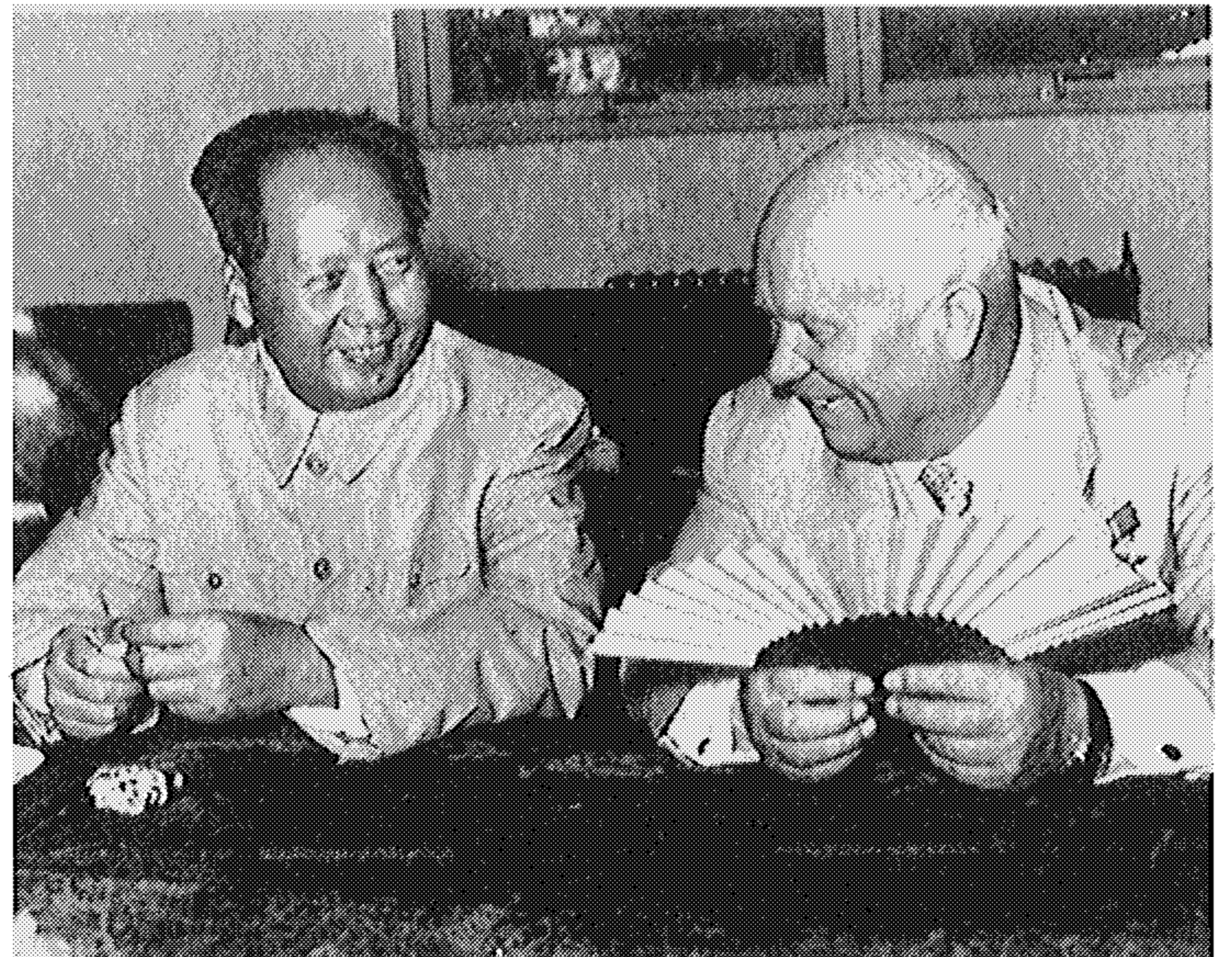
(Right) Khrushchev with Mao on his visit to China in July, 1958.

Against this background the 'Great Leap Forward' was launched in 1958. While the policies of this period marked a sweeping and open departure from the Soviet model, they were by no means so one-sided and simplistic as they have commonly been made out to be in recent years. Mao placed stress equally on moral and material incentives, on 'redness' and expertise, and on large- and small-scale industry. The policy of 'walking on two legs', which was at the heart of his whole economic strategy, was a policy of walking as fast as possible on both of these legs, and not of hopping along on the leg of small-scale indigenous methods alone. In no sense was Mao a partisan (like some of his admirers in the West) of a 'steady-state' or planned zero-growth economy. On the contrary, throughout the twenty-seven years during which he presided over the destinies of the Chinese People's Republic, Mao never ceased to call for rapid economic