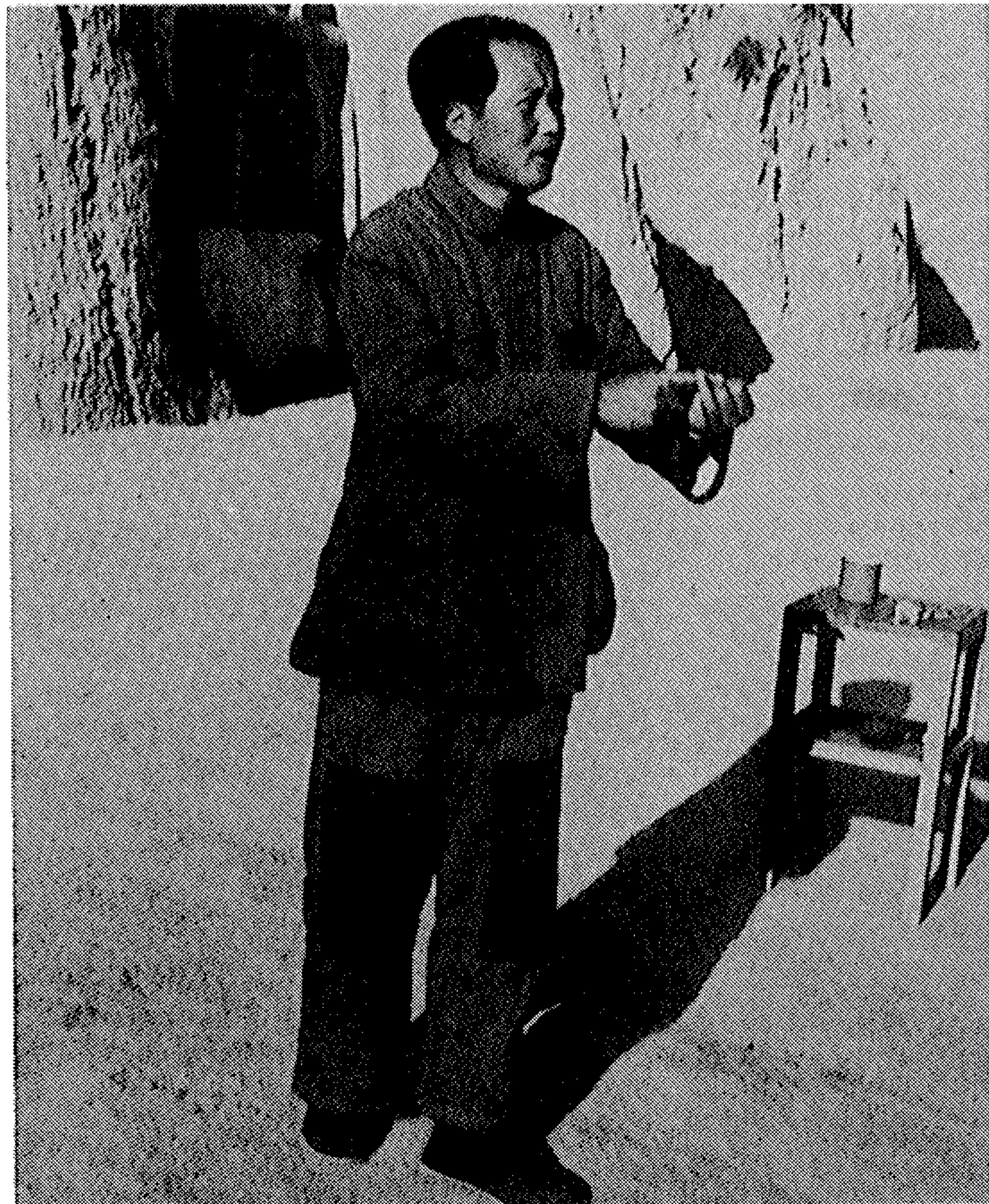
(Left) Mao lectures in Yan'an, 1942, and (below) talks with some 'little devils' of the eighth Route Army at Yan'an, 1939.

In 1939-40, Mao coined the term 'New Democracy' to characterise the current stage of the Chinese revolution. This concept was largely derived from the ideas of Lenin regarding a 'bourgeois-democratic' stage in the political development of relatively backward countries such as Russia, during which the Communist Party would exercise power in the name of the proletariat, while not pursuing explicitly socialist goals. Lenin had referred, in 1905, to the 'Revolutionary-Democratic Dictatorship of the Workers and the Peasants'. Mao, summing up in June, 1949, the conception he had elaborated during the intervening decade of internal and external struggles, culminating in three years of renewed