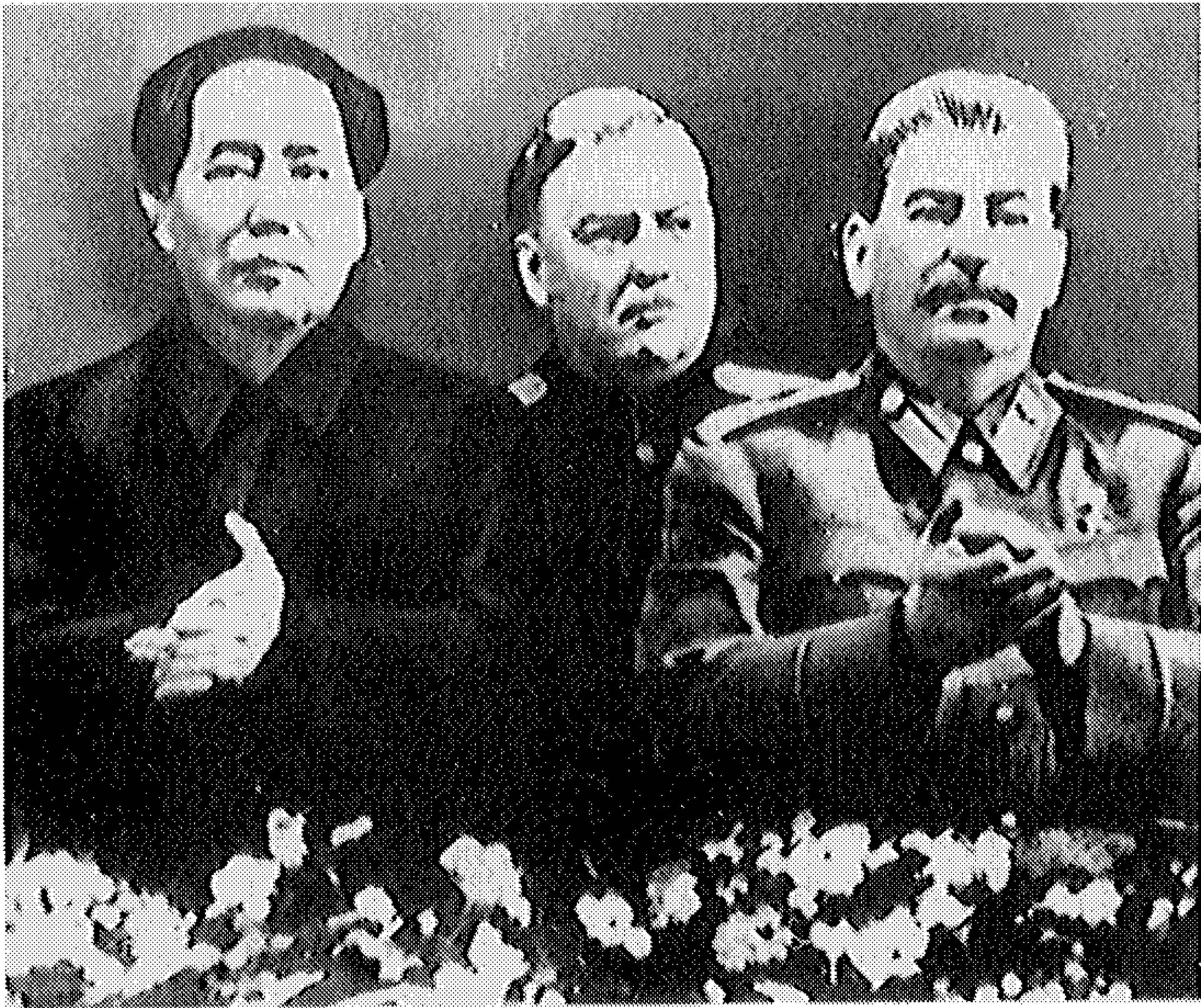
(Left) Mao with Stalin in Moscow in 1950. Marshal Bulganin stands behind them.

While Mao took as his goal to build China into a 'powerful modern socialist state', there were aspects of his approach to development that reflected a certain ambiguity toward the implications of technical progress. One lay in his attitude toward the intellectuals, the bearers of modern knowledge. In January, 1956, he had declared that, in achieving the 'great goal' of 'wiping out China's economic, scientific, and cultural backwardness within a few decades', the 'decisive factor' was to have 'an adequate number of excellent scientists and technicians'. Two years later, disillusioned by the behaviour of the intellectuals during the 'Hundred Flowers' period, Mao said bluntly: 'Ever since ancient times the people who founded new schools of thought were all young people without much learning. They had the ability to recognise new