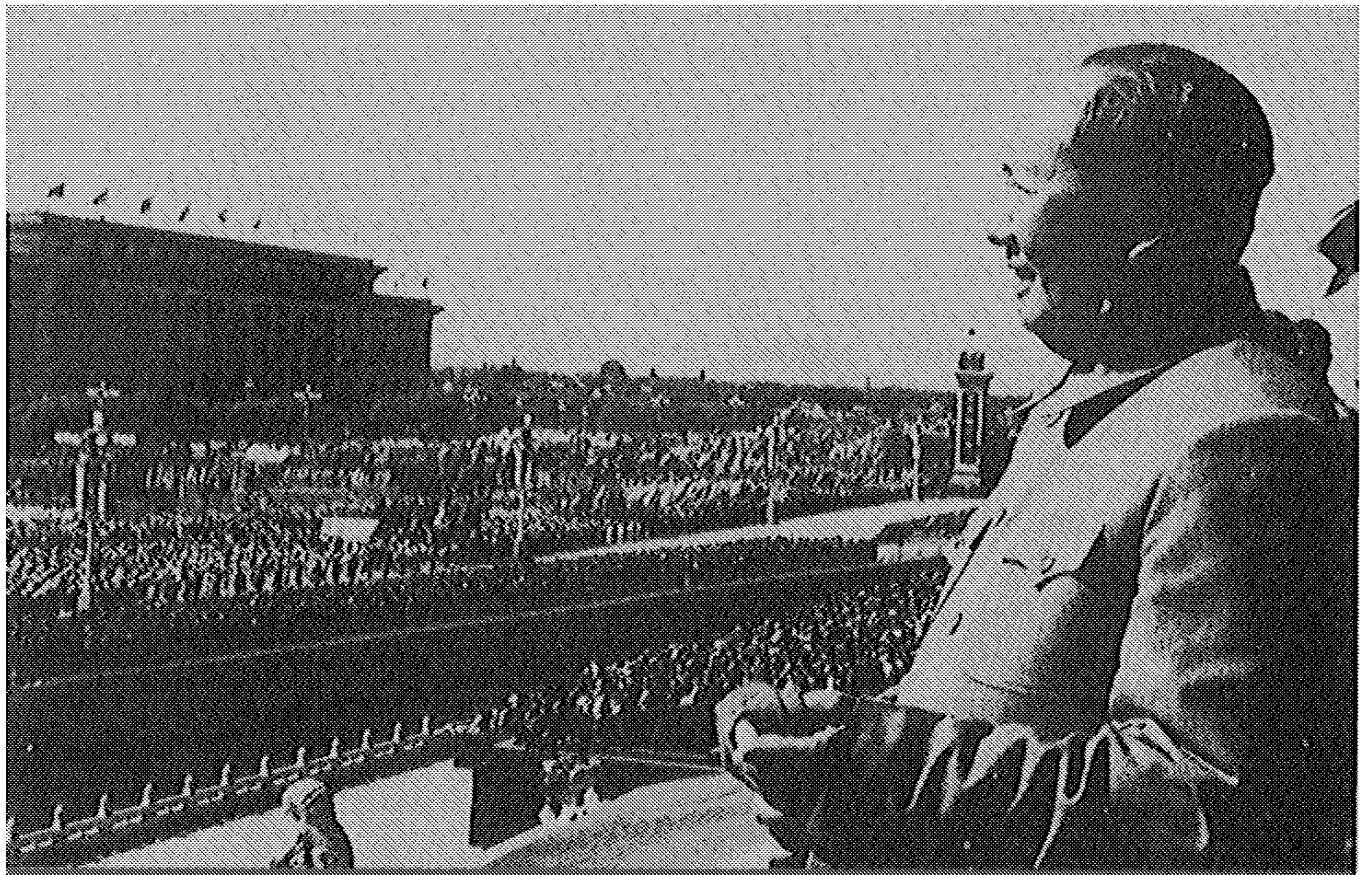
Mao Zedong had an all-pervasive influence in Chinese life: (above) Mao reviews one of the first Red Guard rallies in Beijing in 1966; (below) peasants in an agricultural commune bag rice from mounds topped with Mao's portrait, 1968, under a banner reading 'We respectfully offer our loyal hearts to Chairman Mao'.

The action which inaugurated this trend, a sharp increase in the rate of formation of agricultural co-operatives, did not appear on the face of it to contradict the Soviet model at all. Enforced collectivisation in the countryside had, after all, been very much a hallmark of Stalin's Russia. The crucial point was, in fact, not so much the decision as the way in which it was imposed by Mao on his comrades, and the resultant tension between his personal authority and the role of the Party's policy-making bodies.