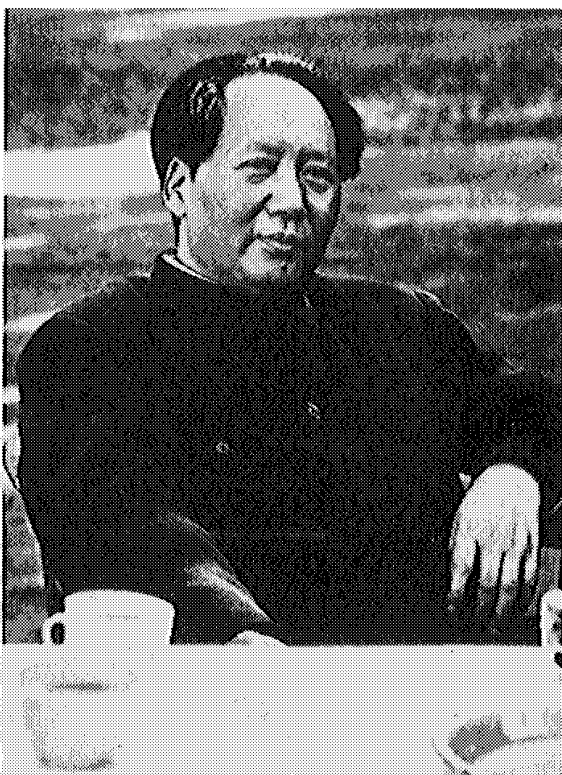
Mao Zedong photographed in Beijing in 1949, shortly after assuming power as first Chairman of the People's Republic of China.

China as offering an alternative pattern, possibly more suited to Asian conditions. The decision of the Paris Peace Conference to hand the former German concessions in Shandong to Japan, rather than return them to China, contributed to the disillusionment with the West, and called forth student demonstrations in Peking on May 4th, 1919, which have given a name to this period of rapid and decisive change, now commonly known as the 'May Fourth Era'.