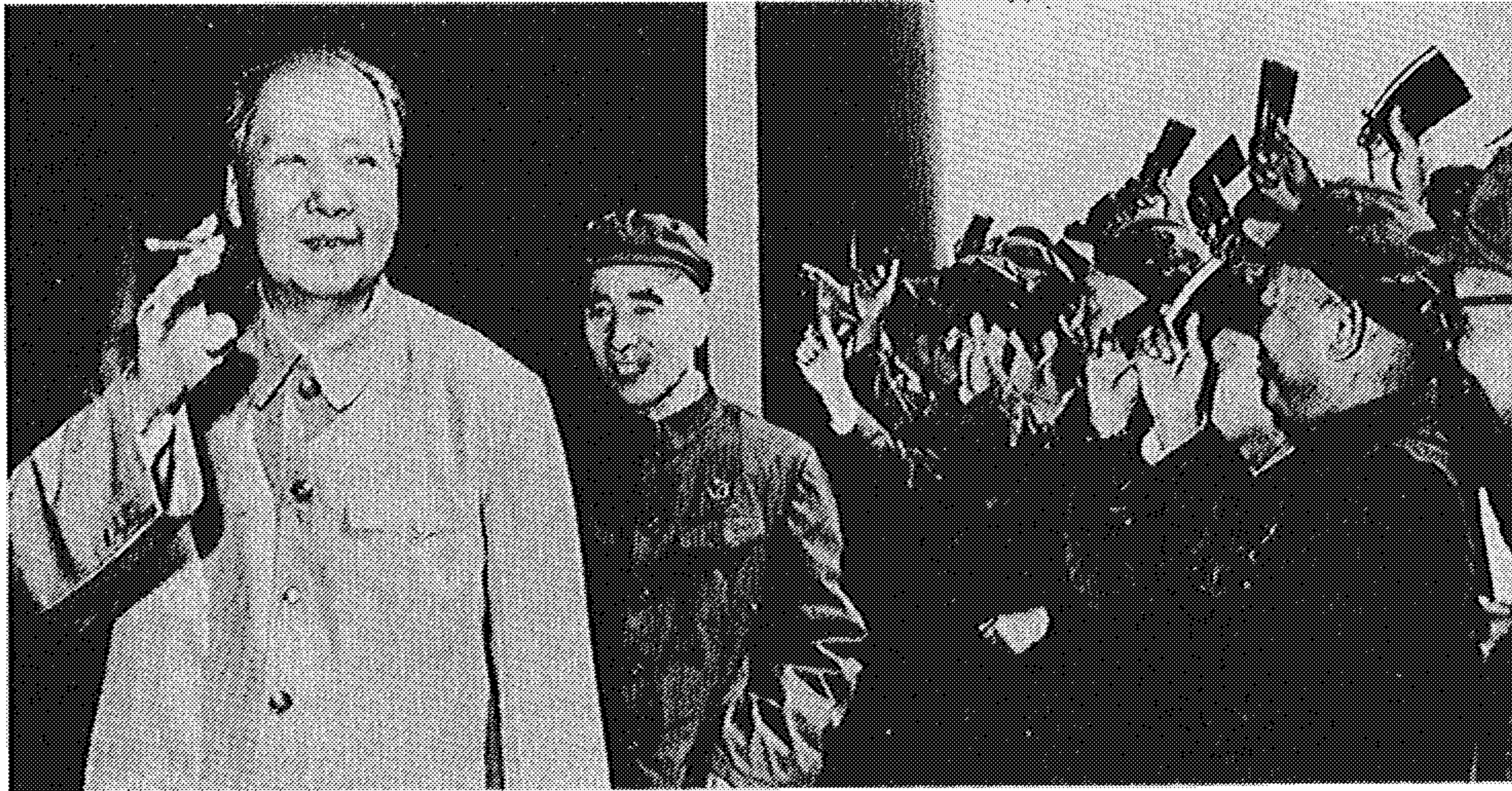
Mao with Lin Biao receives acclamation from members of the army, each waving his Little Red Book.

In 1949 Mao set up a 'people's democratic dictatorship' to carry out a 'new democratic' revolution which would be a kind of functional equivalent of the capitalist stage in the development of European society, in the sense that it would serve to liquidate pre-capitalist survivals in Chinese society and culture. One dimension of this process was to be, in Mao's view, the promotion of democratic values in place of the traditional hierarchical and bureaucratic spirit. But the experiment in a freedom of speech