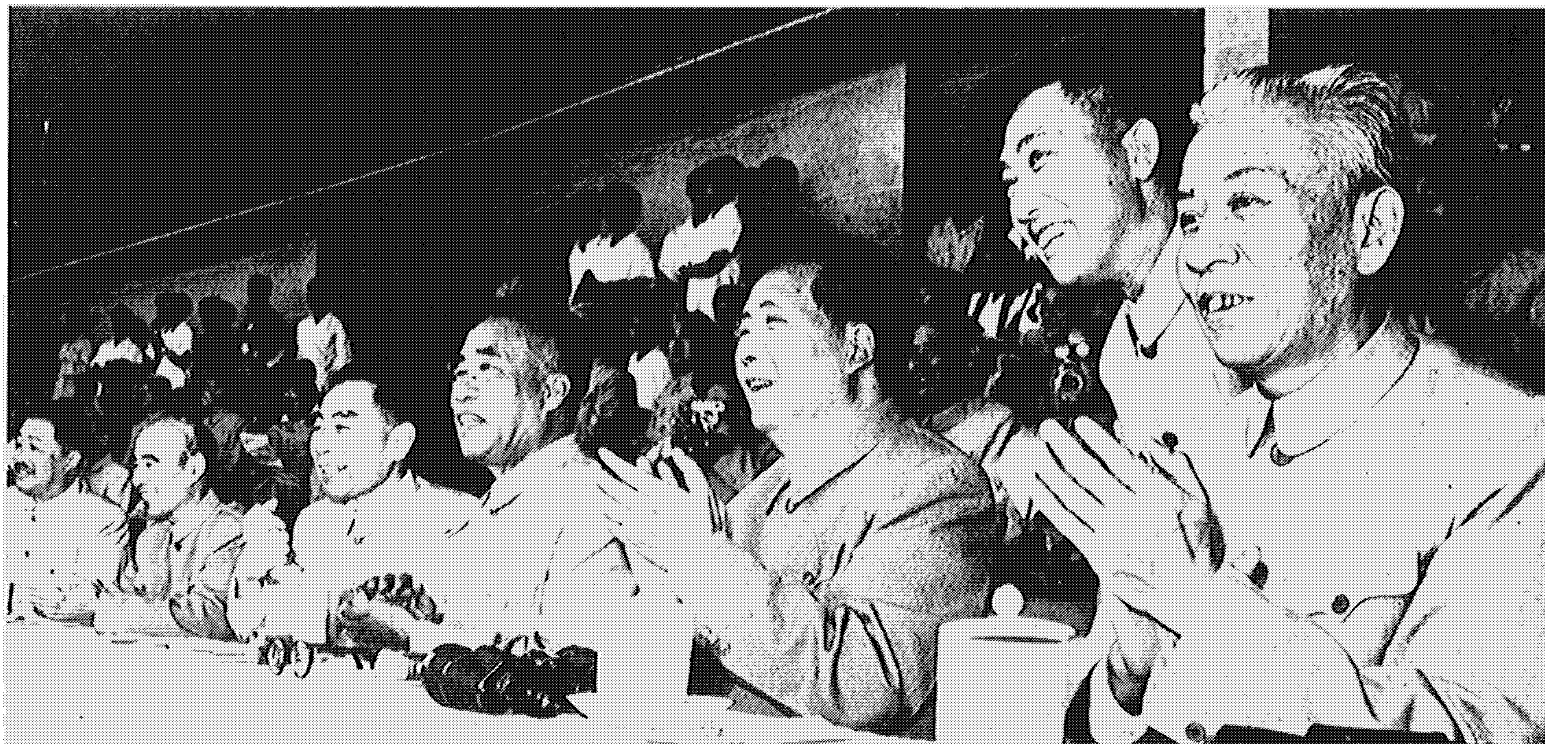
The Chinese leadership at the first National Games in Beijing, September, 1959. Left to right: He Long, Lin Biao, Zhou Enlai, Zhu De, Mao Zedong, Liu Shaoqi.

fended his policies - in particular the communes. By spring, 1959, he had acknowledged that some adjustments were necessary, including decentralisation of ownership to the constituent elements of the communes (teams and brigades), and reduction in their size to more human and manageable proportions. But he insisted, against the almost unanimous opinion of other Party leaders, that the concept of the communes, and the belief that China, though 'poor and blank', could leap ahead of other countries, were basically correct. Only Peng Dehuai, the Minister of Defence, was bold (or naive) enough, among all the top leaders, to challenge Mao openly at the Lushan meeting of July-August, 1959, but the others saw the handwriting on the wall, and henceforth the conflict was irreconcilable.